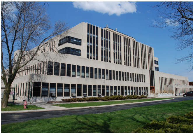
U.S. Forest Products Laboratory located in Madison, Wisconsin.

The Forest Products Lab, a branch of the USDA Forest Service, has stood as the country's central research facility in the work related to the promotion of healthy forest and forest-based economies through the efficient, sustainable use of our wood resources in Wisconsin and throughout the United States. The FPL was established in 1910 with its research beginning with the preservation of railroad ties and the creation of low-cost housing. Throughout World War I and World War II, FPL made significant contributions to the nation, using fundamental information on wood properties, fasteners, and engineering design to assist in the war efforts. Since then the lab has branched out into research in mycology, truss-frame construction and forest management, becoming a strong advocate in the efficient use of forest resources and recycling efforts.